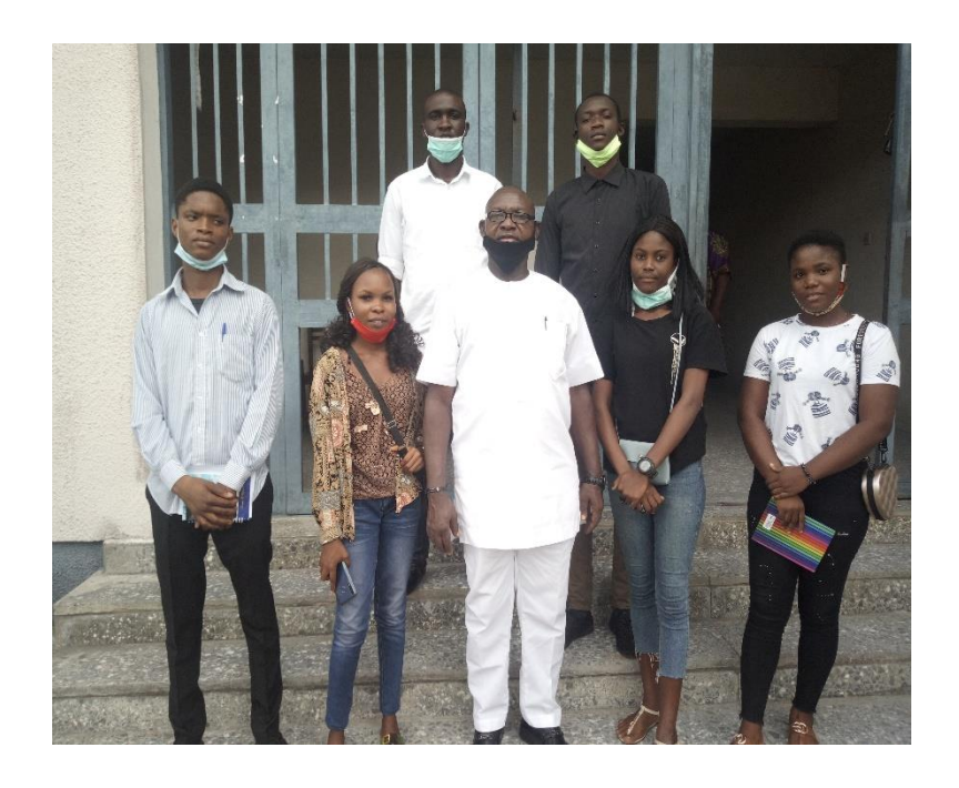
Fig. 5.Cross Section of some Students with Director of Budget

and his team were not left out as they were also commended for their doggedness, eloquence and fearlessness/displayed while the forum lasted.