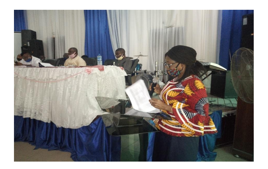
Fig. 3. Presentation by participants

He also informed the forum that elections will soon be conducted by Cross river Independent Electoral commission, so people ruled out the rumors of National independent Electoral body conducting elections for councils.