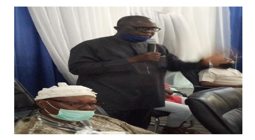
Fig. 4.Response from Civil Society Organization