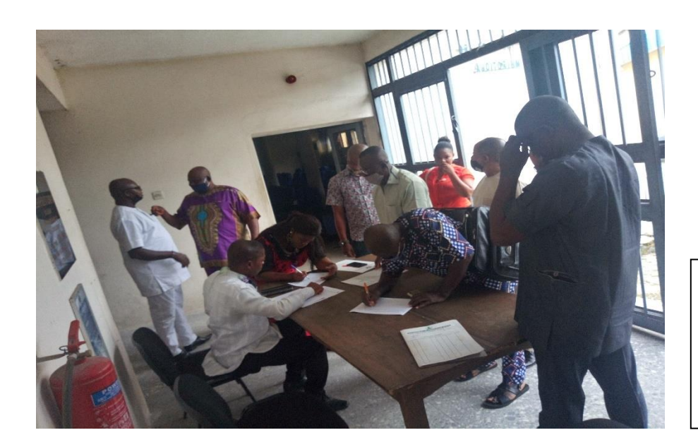
Fig. 2. Cross Section of Participants undergoing registration

In attendance at the Forum were some members of the State Exco, Chairmen of Boards and Commissions, Traditional Rulers, Civil Society Organizations (CSO's), NGO/CBOS, Professional groups, Budget Officers from MDAs and a Cross Section of students.