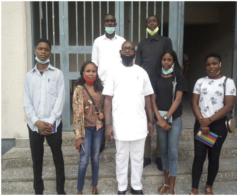
Fig. 5. Cross Section of some Students with Director of Budget

and his team were not left out as they were also commended for their doggedness, eloquence and fearlessness/displayed while the forum lasted.