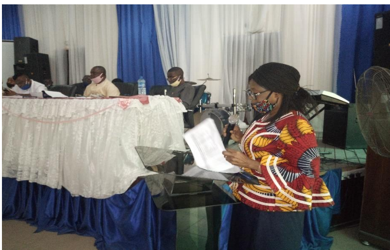
Fig. 3. Presentation by participants

He also informed the forum that elections will soon be conducted by Cross river Independent Electoral commission, so people ruled out the rumors of National independent Electoral body conducting elections for councils.