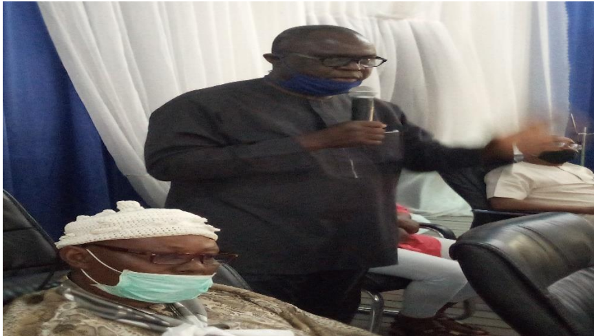
Fig. 4. Response from Civil Society Organization