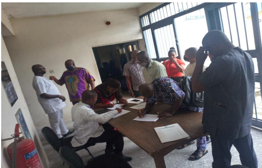
Fig. 2. Cross Section of Participants undergoing registration

In attendance at the Forum were some members of the State Exco, Chairmen of Boards and Commissions, Traditional Rulers, Civil Society Organizations (CSO's), NGO/CBOS, Professional groups, Budget Officers from MDAs and a Cross Section of students.